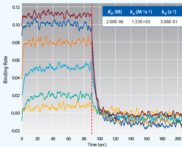
FIGURE 2: Small molecule kinetics. Example data from benzenesulfonamide (MW 157 Da) binding to biotin-carbonic anhydrase loaded on Super Streptavidin biosensors. Binding was performed at 30°C, with a shake speed of 1000 rpm. A 100 \mu M benzenesulfonamide solution was prepared and serially diluted 1:4.